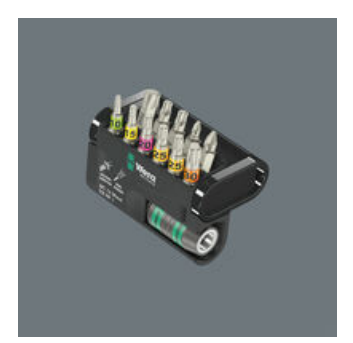
The Bit-Checks can be positioned upright at the workplace so the tool is always quickly to hand.