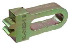
Application example: KL-0182-1 B