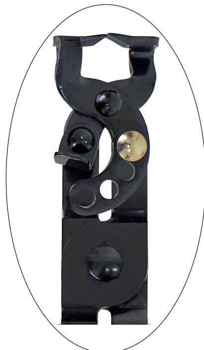
Pliers head, 90° adjustable