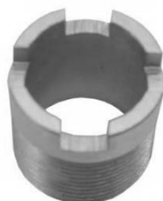
Pressure nut (MAN / Mercedes)